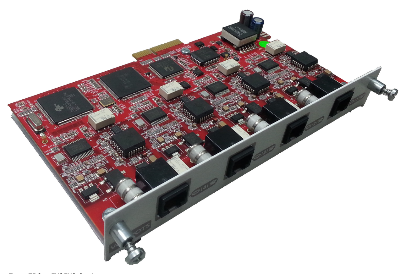
Fig. 1: TBC1-4FXSFXO Card

For further information on VoIP interfaces, please see manual "Teldat-Dm770-I - VoIP Interfaces".